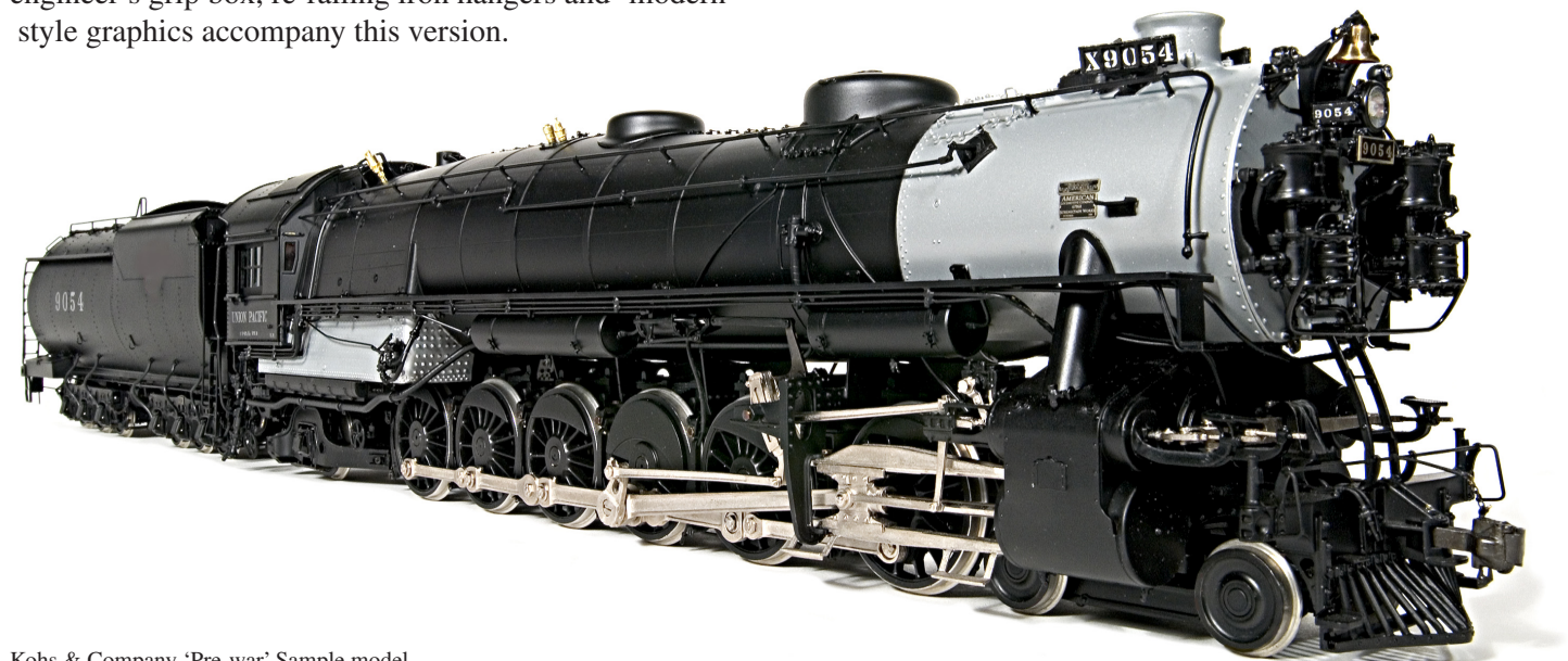
Kohs & Company 'Pre-war' Sample model

Post-war Configuration: this configuration became the final evolution of the class, most all UP 'types' in service after WWII received the treatment shown immediately above, once again, UP-3 and UP-4 locomotives and road numbers 9015-9054 are included. Common major characteristics for the 'postwar' rebuilds were: retro-fitted cast steam cylinders, five (5) exposed sander lines, Boxpok style #3 main drivers, strap iron 'ATC' equipped pilot, late style trailing truck, late style main & side rods, E-2 radial buffer, relocated and widened cab, modified side cab windows, hatch type roof ventilators and modified air pumps. A modified 18C tender equipped with a stoker engine relocated from the locomotive, extended coal boards, an engineer's grip box, re-railing iron hangers and 'modern' style graphics accompany this version.