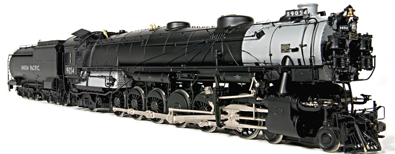
Kohs & Company 'Post-war' Sample model